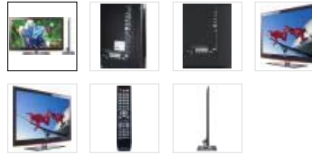
Front and side views

Samsung UN40B6000 LED TV Ultra-thin 40" 1080p LCD HDTV with 120Hz anti-blur technology and LED backlighting