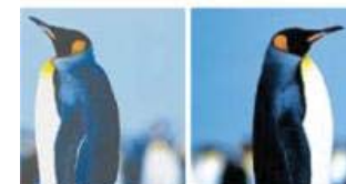
Conventional Samsung LED TV

More Dynamic Contrast Samsung LED technology enables a true-to-life range of picture brightness from pure blacks to pristine whites.